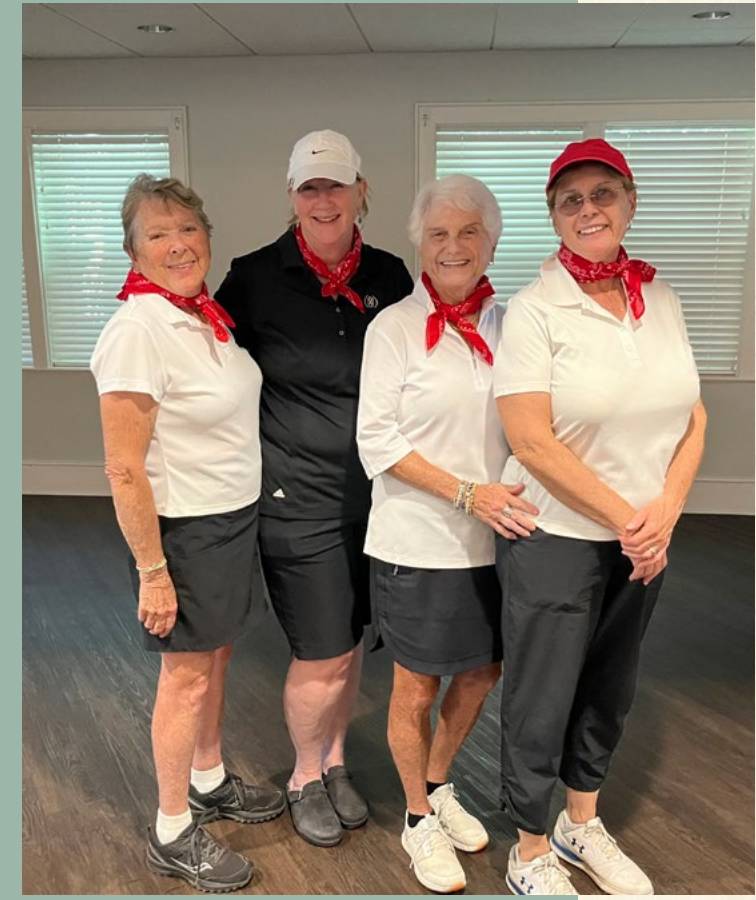
St Charles Invitational: 2nd Flight Winners