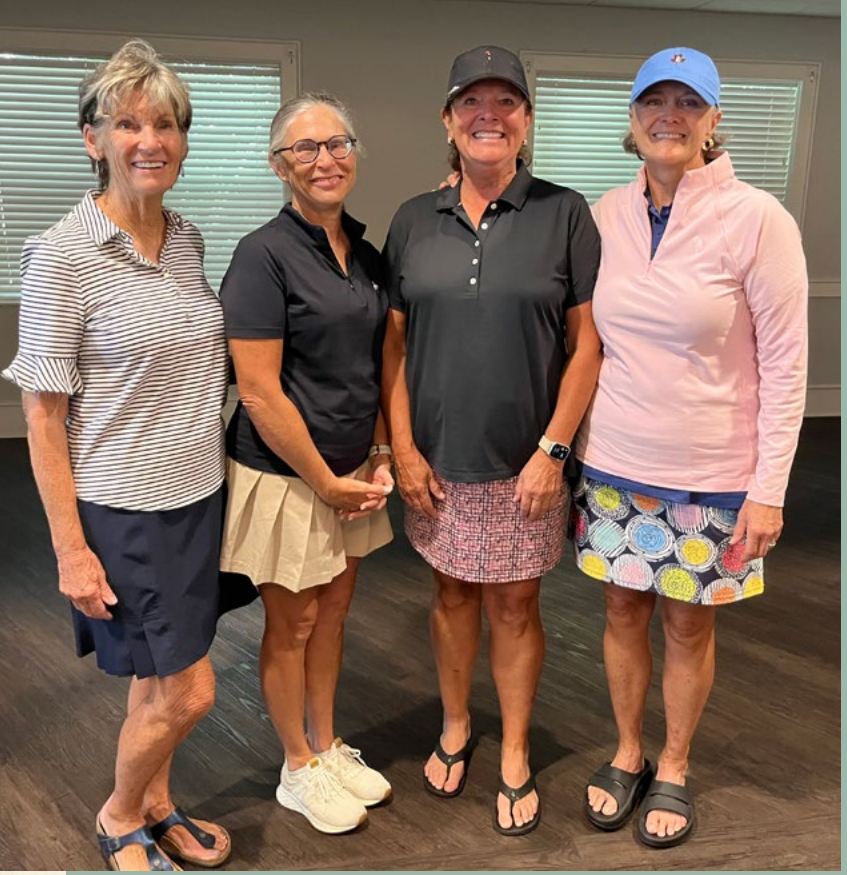
St Charles Invitational: 1st Flight Winners